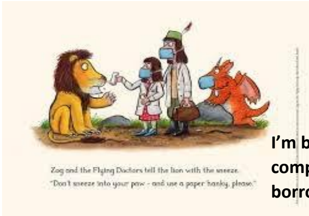
Zog and the Flying Doctors tell the lion with the sneeze. "Don't sneeze into your paw - and use a paper hanky, please."

https://theday.co.uk/stories/how-too-much-news-can-mess-with-your-head .