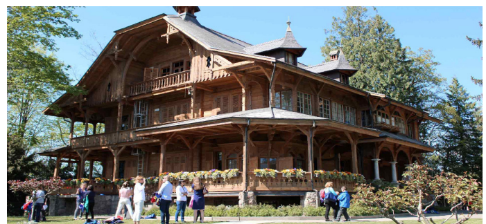
Boarding chalet at St George's International School