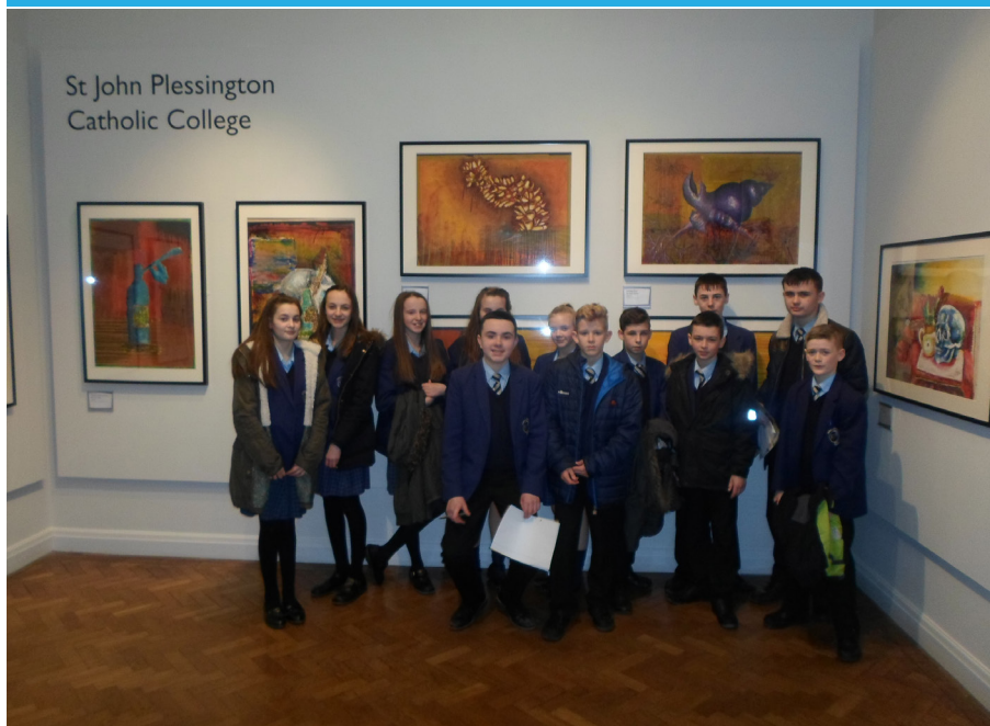
St John Plessington Catholic College