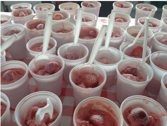
Easy Strawberry Ice Cream

Due to the abundance of strawberries in the poly tunnel last week, SJP's Food Revolution team had to whizz up some delicious but very easy to make strawberry ice cream! A big thank you to all who supported the event which managed to raise £48 for Street Child Africa.