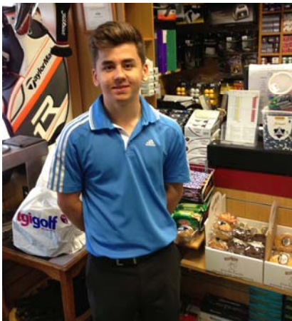
Year 12 student on his work experience at Eastham Lodge Golf Club.

I would like to thank all the companies who gave our Year 12 students an opportunity to complete their work experience.