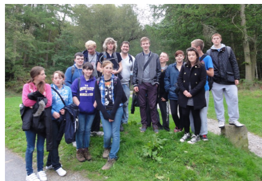
Photos from some of the fundraising events that took place last year.

Comments from Parents Evening "Sincere thanks to all the teachers and staff for their hard work and dedication" "Excellent School"