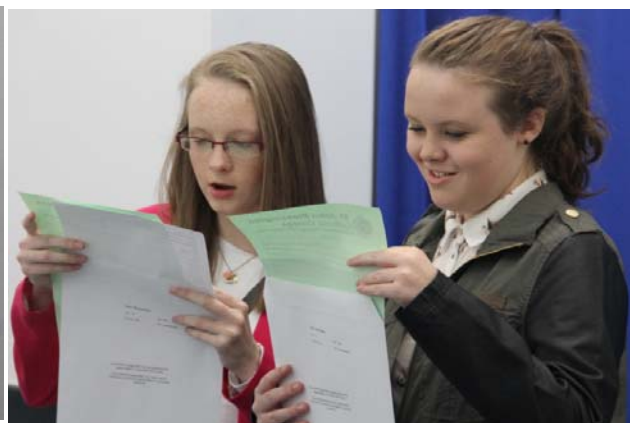
Small class sizes making all the difference