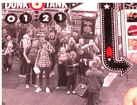
This picture shows the students on the big screen in Times Square.

The group walked to the most visited tourist attraction in the world; Times Square, with over 39 million visitors each year. Students spent their last few hours purchasing last minute souvenirs for their families and taking final pictures.