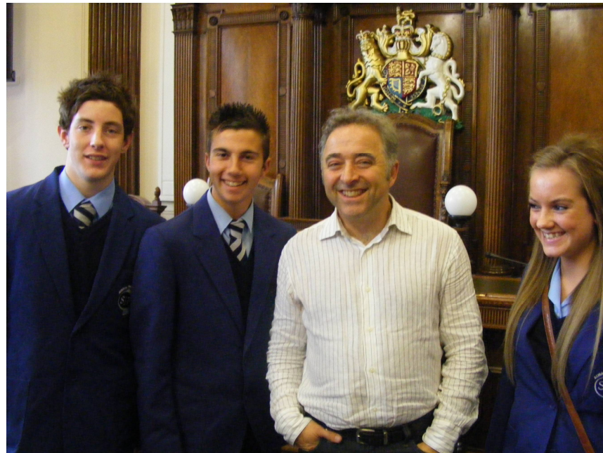
Pupils celebrate National Year of Reading with Frank Cottrell Boyce

Open our eyes to see, Open our ears to hear, Open our lives to live your calling, Open us Lord, to love.