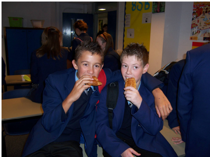
Year 9 enjoying croissants and jus d'orange at the French Breakfast