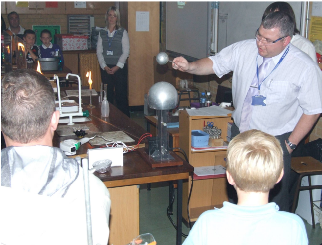
Jelly Bean Experiment—Science