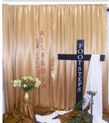
The Easter Garden in the College Atrium.