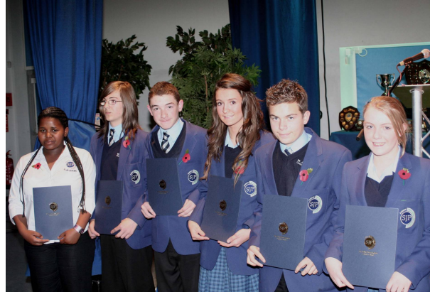
Pupils receive subject awards

It was a very proud moment for many parents who watched their children being awarded certificates, trophies and medals for their achievements Eighteenth Annual Awards Evening . It was a momentous occasion for 200 pupils from Y7-13 as they came up on stage and were awarded their prizes by Frank Cottrell Boyce, the well known Liverpool screenwriter, playwright and novelist. The occasion was also made special by the choir who provided us with a truly professional quality of singing. Frank Cottrell Boyce delivered an amusing and meaningful speech to the audience, encouraging children to keep their happy memories close to their hearts and to continue to strive for achievement. The evening finished with light refreshments where parents and guests were served canapés, wine and soft drink in the atrium. This Awards Evening brought home to us just how well our pupils are doing and reminded us that we have so much to celebrate at SJP.