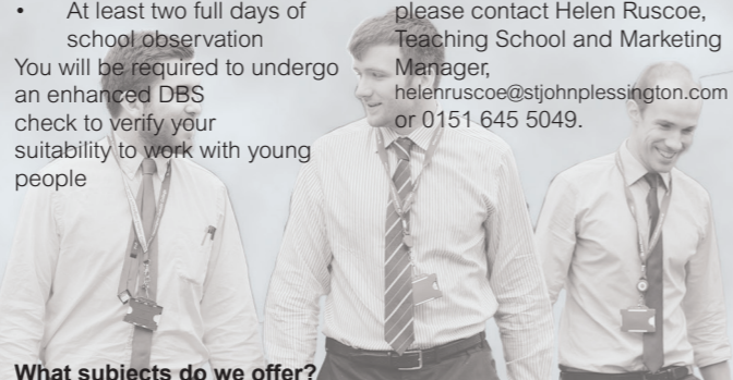
What subjects do we offer?