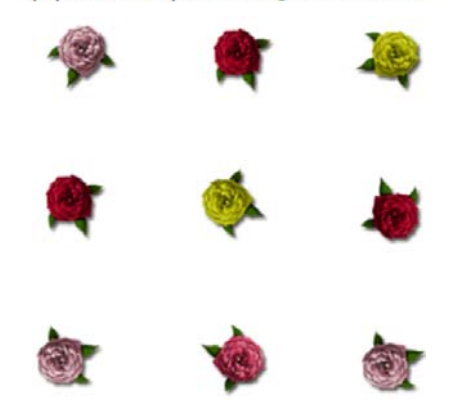
Solution for last week

Can you draw 4 straight lines, without taking your pencil off the paper, which pass through all 9 roses?