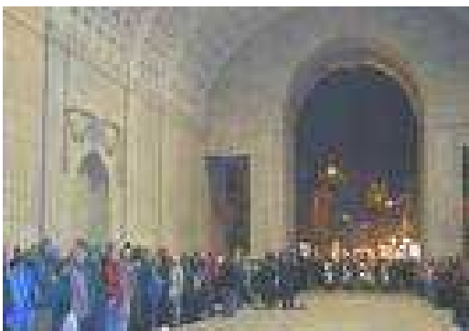
Menin Gate Last Post Ceremony