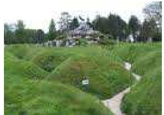
The Trenches at Newfoundland Park

On Saturday morning, we drove to the Somme in France to visit battlefields and memorials. A site of particular interest was Newfoundland Memorial Park. Here, pupils had a guided tour of the trenches and experienced the view over no mans land, as the soldiers would have seen during the war.