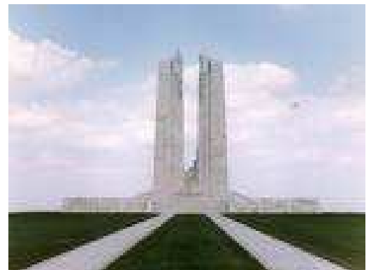
Vimy Ridge Memorial

The pupils experienced many aspects of the war, and gained a greater understanding of the vast loss of life and destruction that happened throughout Belgium and France.