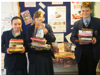
Pupils holding some of the Free Books

In March pupils from Years 7, 8 and 9 spent an enjoyable lunchtime celebrating World Book Day by dressing up as their favourite book characters. This was followed a week later by a Book Fair which proved to be hugely successful and throughout the week our school raised £529 in free books for our College library.